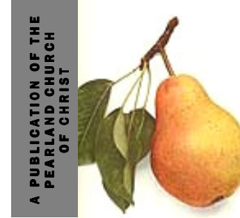
A PUBLICATION OF THE PEARLAND CHURCH OF CHRIST